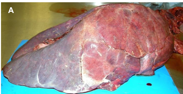
Figure 2: Lungs of weaned pigs with disease due to confirmed PRRS together with (2A) Pasteurella multocida or (2B) Haemophilus parasuis infections

The Pig Veterinary Society ( http://www.pigvetsoc.org.uk/ ) held a discussion session on PRRS control at its meeting in November 2017 at which support was demonstrated for funded regional or national initiatives for PRRS control. Updates on the findings from PRRS diagnoses in the GB surveillance network and any changes in diagnostic trends are included periodically in the quarterly pig disease surveillance reports: https://www.gov.uk/government/collections/animal-disease-surveillance-reports#pig .